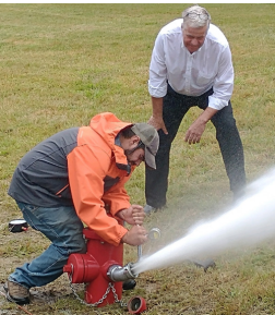
Meetings and Trainings